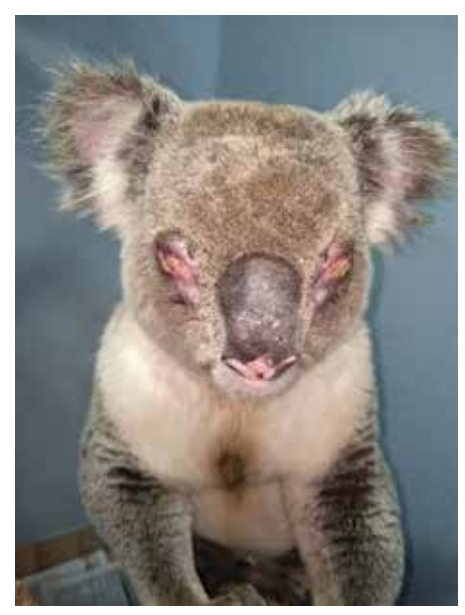
Koala with conjunctivitis

Chlamydia is a horrible disease for koalas, it causes extreme suffering and pain and is often fatal.