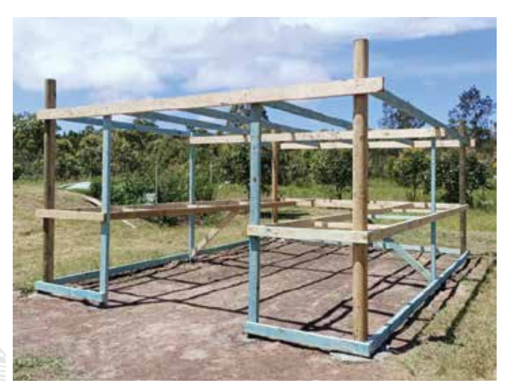
Maria Rive Plantation nursery takes shape

Our first koala tree and plant nursery is now established. More than 5,000 new koala food trees have been planted at Maria River.