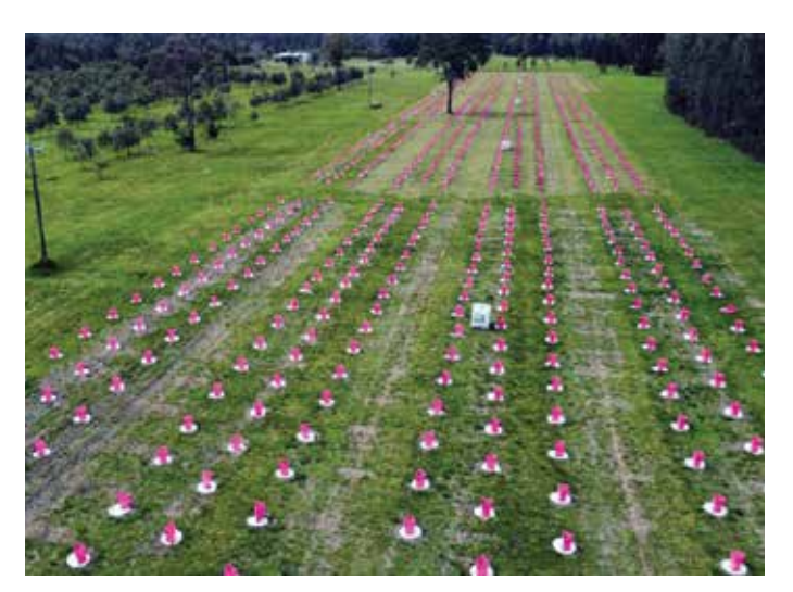
New plantings at Maria River Plantation

at our Moripo Plantation, west of Wauchope. With the careful attention of Koala Hospital volunteers over forthcoming years, these trees will support the rehabilitation of sick and injured koalas into the future.