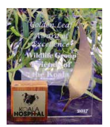
2017 Golden Leaf Awards

Koala Conservation Australia will once again host and present the 'Golden Leaf Awards of Excellence', in effect the 'Academy awards of wild koala conservation'. It is a