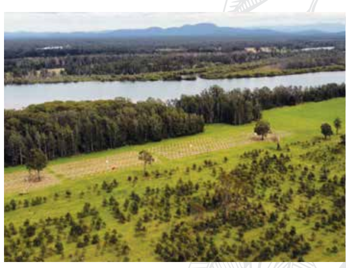
Aerial view of Maria River Plantation

Late last year AARA planted 1,000 trees, donated by Forestry Corporation of NSW. The trees are all koala food trees and the varieties comprised tallowwood, swamp mahogany, grey gum and forest red gum. In