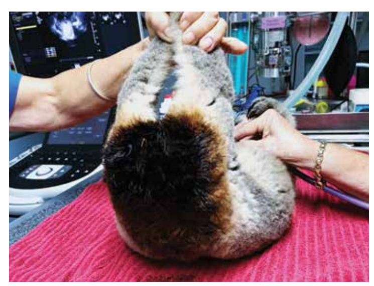
Koala with 'wet bottom'

Look out for updates about the research projects in future Gum Tips.