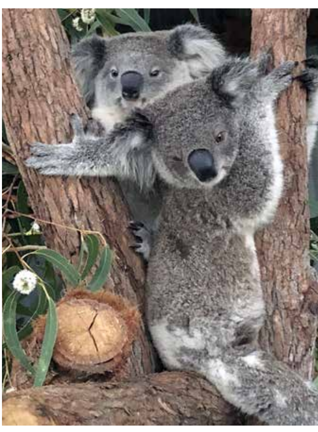
Two healthy joeys

Rebuilding koala numbers and reversing local extinctions will be key to the survival of the species.