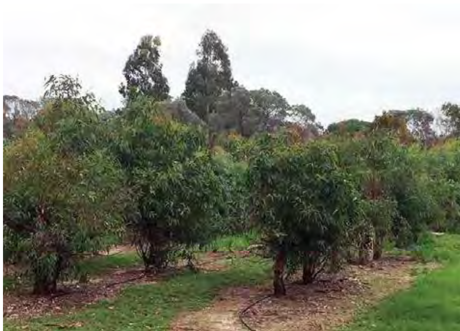
Swamp Mahogany at Maria River plantation.

To give an example, in the Port Macquarie Koala Hospital (PMKH), the koalas are often provided with Tallowwood ( Eucalyptus microcorys ) as this tree is on the list of preferred koala food trees. Tallowwood always has a very high protein content, making it appealing nutritionally, but the concentration of a group of PSM toxins called unsubstituted B-ring flavones (UBFs) varies wildly.