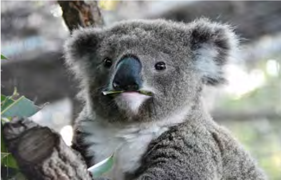
Goolah with a mouthful!