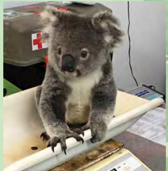
Weighing in at the Koala Hospital.

When you Adopt a Wild Koala, you help to keep the important work going! You, your business, a friend or family member can each make a positive contribution to the survival of these marsupials.