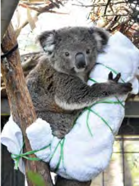
Towels help to protect sore, burnt feet when climbing.

Rescued koalas are normally returned to the home range in which they are found.