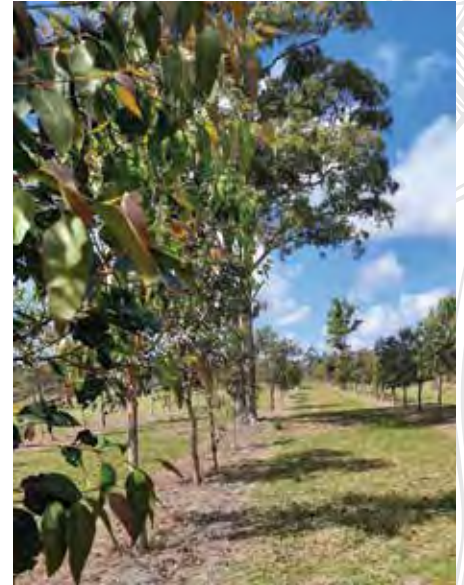
Young eucalypts at Maria River plantation.

UBFs deter koala feeding above a certain concentration. Below this concentration the koalas will eat a lot of Tallowwood to access all that protein. Above this concentration they will eat less and less, as the concentrations of UBF's become too much, the koala will not be able to eat it at all. That is one reason why, on some days when we offer the koalas Tallowwood, they eat lots of it, but on other days they might not eat it at all.