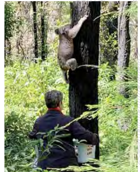
Sue farewells our last bushfire patient.