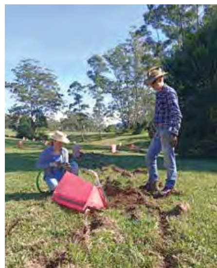
Watering in newly planted seedlings.

When choosing trees for Koala habitat plantings you should