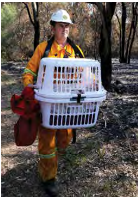
A koala is rescued and taken to safety at the Koala Hospital.