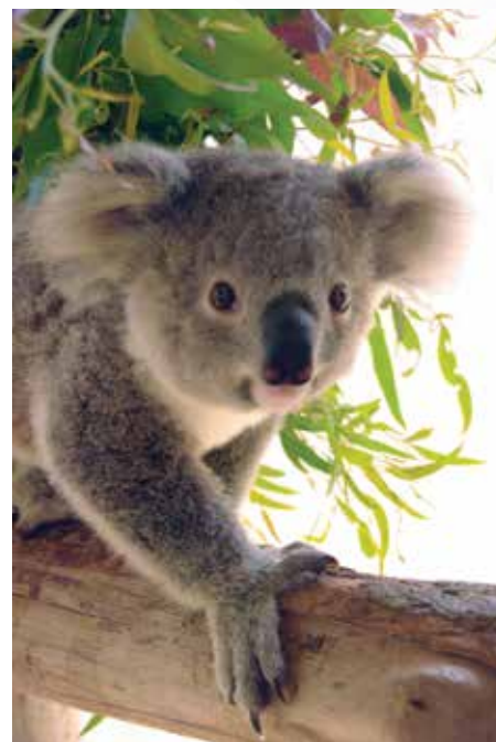
Livy, our cover koala, is in homecare because tragically her mother died following a car accident in August.

Like Port Macquarie Koala Hospital, most wildlife organisations are not-for-profits, and rely on public donations. Consider donating regularly to help them continue their work. Your local organisation may even need more volunteers!