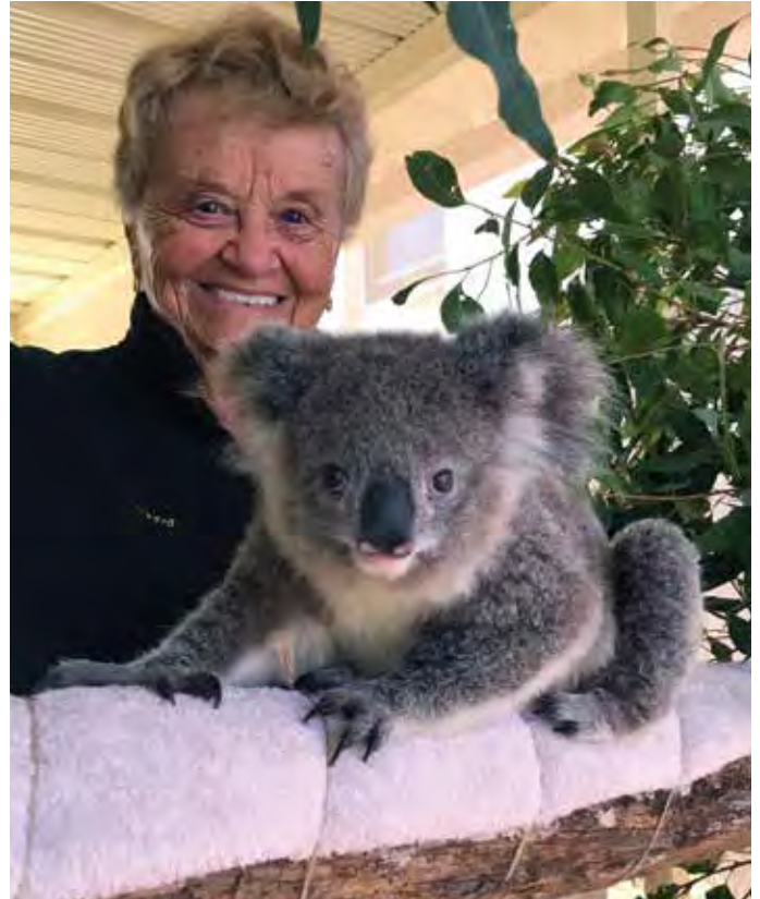
Barb with Long Flat Joy. Following many months of homecare and rehabilitation Joy was successfully released back to the wild in April this year.

There is also an interesting developmental stage, when very young pouched joeys need to be 'papped'. Pap is vital, a special poo provided by their mother