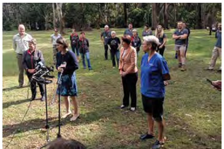
Land transfer announcement, observing social distancing