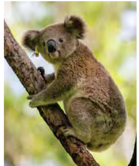
This koala spent several months in care with the Port Macquarie Koala Hospital because her home had been destroyed by bushfires in late 2019. She was released in regenerating bush in April 2020.