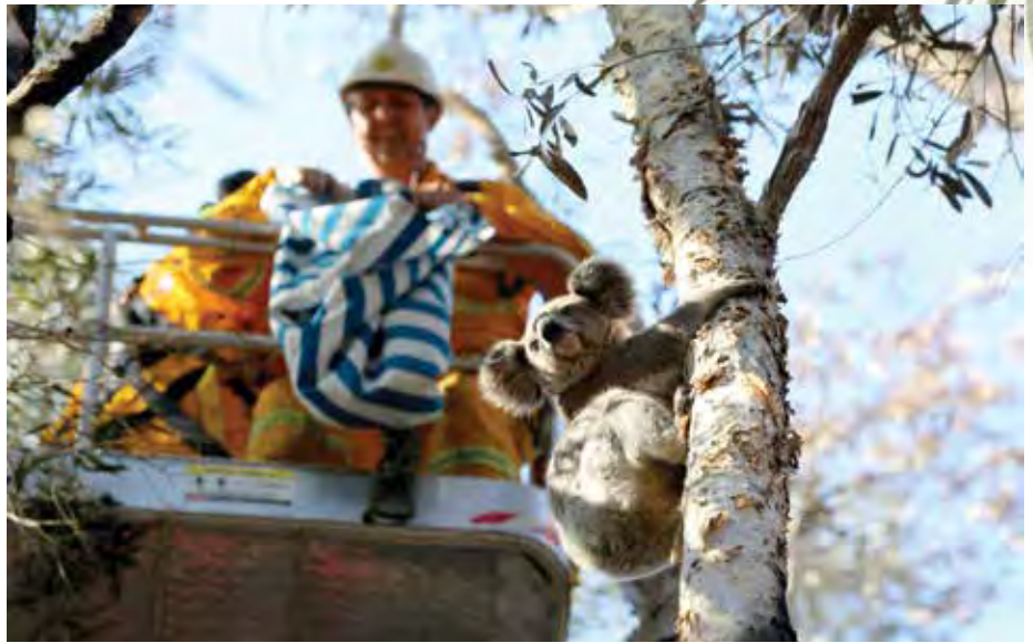
An elevated work platform helps in the rescue of a koala in burnt out forest.

of expertise. It was so important that we listened to each others' knowledge and experience before agreeing strategies and next steps'.