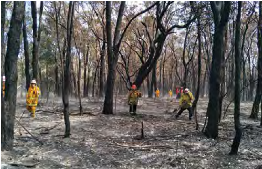
The team fans out over a fireground, checking for signs of wildlife.

Our volunteers contend with heat, hazardous, broken terrain and 'hot spots', where fire may still be burning underground. There is a real likelihood that branches will fall from burnt and damaged trees. Rescuers wear thick, protective suits, heavy boots and hard hats; they carry packs and drinking water, as they methodically search firegrounds, constantly scanning the trees and remaining alert to their surroundings. Rescues can be hard, as the team work together to capture stressed and potentially badly-injured wild animals. A Koala Hospital volunteer for many years, Sheila Bailey, had worked on firegrounds before, but her experiences last fire season will always remain with her. 'It was