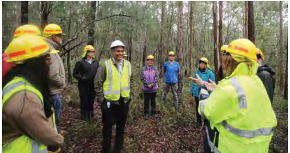
Collaboration on-site for masterplan development.

The scientific research program will follow best practice guidelines in building a breeding facility, populating it from a 'stud book' and breeding healthy disease-free koalas for release under guidelines stipulated by both the