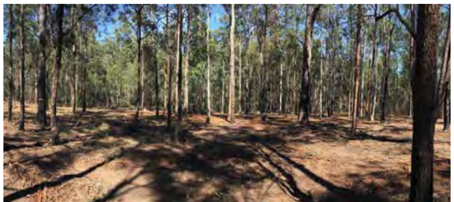
Cowarra State Forest, following a cultural burn performed by Bunyah Local Aboriginal Land Council and Forestry Corporation NSW.