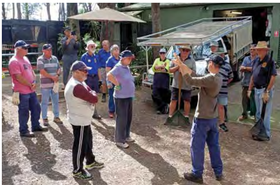
Lions volunteers are briefed on the morning's activities at the start of their working bee.

Tacking Point Lions Club continue to provide their time and hard work, running 'working bees' on site at the Koala Hospital. This photograph was taken just 2 weeks ago, when Lions volunteers spent several hours clearing leaf litter and fallen branches and bark from the Hospital grounds.