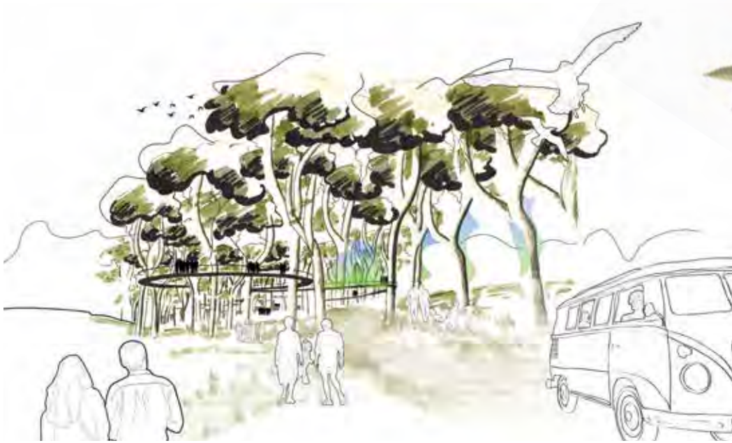
Artist's impression of the facility.

but an obligation to protect wildlife and habitats that are increasingly under threat. We are committed to the conservation of native species, with active involvement in breed and release programs, protecting and sustaining wildlife in their natural habitats.”