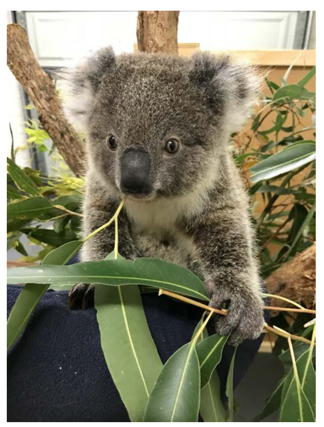
Myoora Jarrah, one of the joeys you can adopt.

Thanking you for your support and we look forward to your visit to our wonderful hospital.