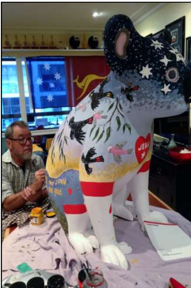
Above: John Williamson the renowned Australian entertainer who is responsible for the artwork on “Sunshine” who resides at the Koala Hospital and a focal point for visitors and photos.

The Koala Hospital is hoping for good crowds to support the Festival and at the events that are associated throughout it’s duration. Hello Koalas Festival and the Conference are both Destination NSW supported events. For more information you can consult the Hello Koalas website at www.hellokoalas.com .