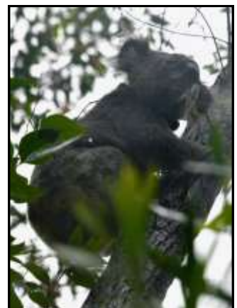
Above: Koalas back home again and happy in their natural habitat.