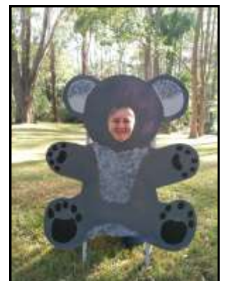
Right: Smile! And you too can look like a happy koala.

Or you can just check out our website for all the Hospital Happenings with all our koalas and events.