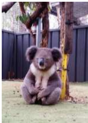
Gunnedah Mr. Bear is a quiet koala, it could be due to his early morning meditation regime.