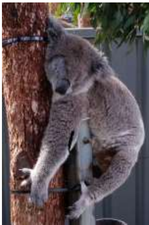
They say that Byabarra Jones can sleep anywhere.....what do you think?

Find us on Facebook Koala Hospital Port Macquarie