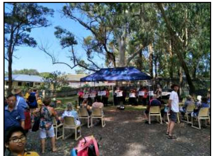
Above: The ukulele group The Amazing Z Chords were on hand again with their unique entertainment.

The Koala Hospital Open Day is held every year on Easter Saturday, so if you were unfortunate to miss our event this year make sure you come and say hello to us and the koalas next year.