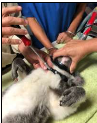
Above: Fitting the tracking collar.

The Limeburners fire caused a major disruption to the koala population in the area forcing them in closer together and changing the dynamics of the normal hierarchy and their food resources. This