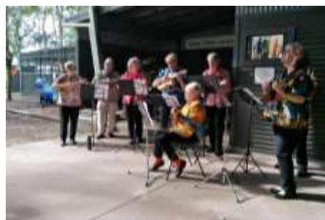
The CHUM's group serenading the koalas and early morning visitors at the Hospital.