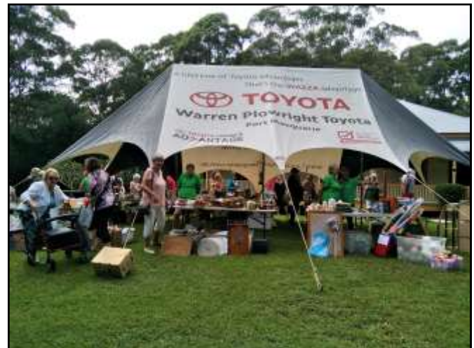
Clockwise from the top: The crowd enjoying a beautiful day at the Open Day / The kids were attended to all day with face painting and the likeness of koalas / Sing Australia entertaining the crowd with their songs and True Blue looking on / The White Elephant stall supplied all manner of articles for the crowd in attendance.

worked tirelessly as always, to ensure that the event this year was a grand day out for families... and indeed it was!