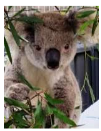
Muston Pud looking extremely photogenic amongst his gum leaves.