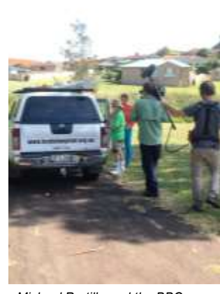
Michael Portillo and the BBC crew recording the release of a koala back into its natural habitat.