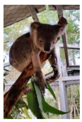
Kundabung Mikha only too happy too show just how sharp his claws are.