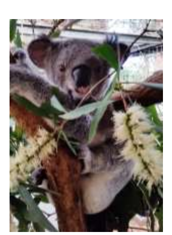
Maria River Road Sheila only too happy to enjoy some quality R&R time at the hospital after the fires.