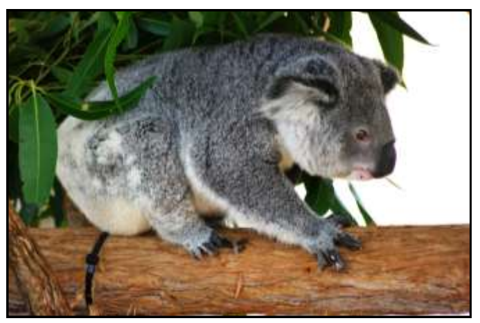
A koala with burnt and disfigured claws from a bushfire shows the difficulty that the animal has to do something as natural as climbing.

Smoke inhalation can be an issue as well if there is a lot of scrubby understory that produces thick smoke. The Koala Hospital has certainly had to admit some of these koalas but thankfully these injuries are usually well treated and most of the time they are successfully released. Alternatively during most of these "control burn low intensity fires" the majority of koalas do not suffer any injuries at all, and remain happily in the tops of the trees munching away where their foliage remains unharmed.