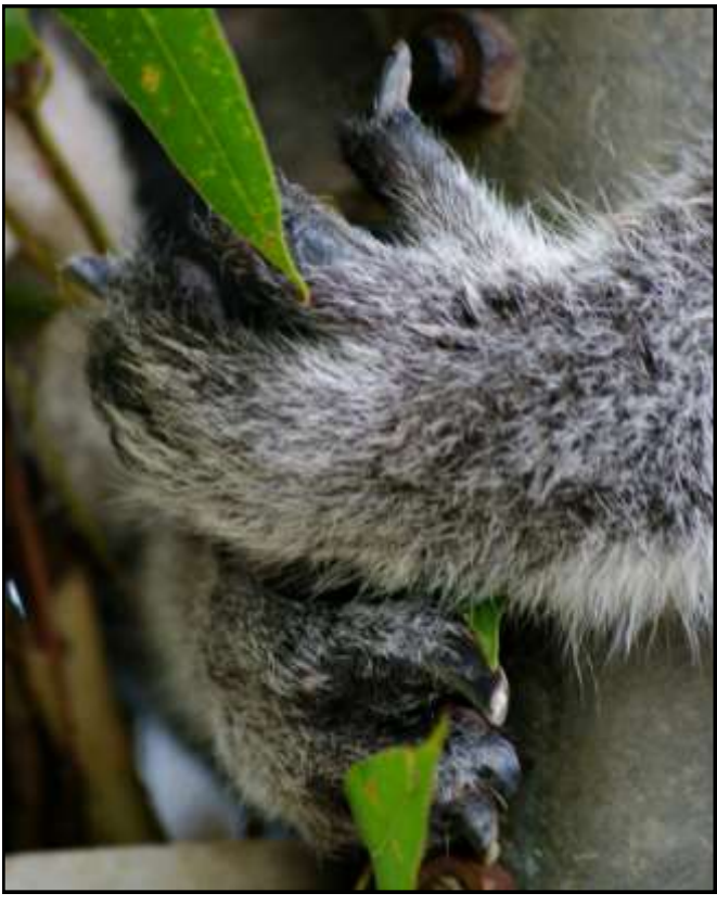
The burnt claws of NATF Zenani that were that badly damaged she could not be released into the wild again.

The Koala Hospital does not go on percentage of burns to the body as occurs in humans – we gauge our burns assessment on burns to the hands and feet. We have had many koalas over the years with minimal burns to the body (and therefore would have been considered to have a very low score on percentage of burns to the body) but have had awful burns to the hands and feet.