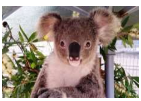
St. Andrews Jude looking almost dazzled to have her photo taken but always willing to help the hospital.