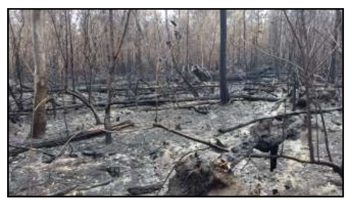
Just a very small part of the blackened landscape left behind by the bushfire as it swallowed all in it's path.

There were helicopters and planes buzzing around. We were in constant contact with all the members in the search teams always on the lookout for ourselves and injured animals.