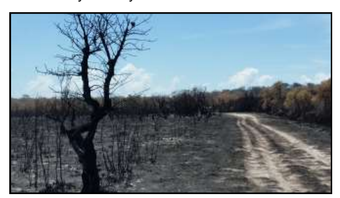
One of the many tracts of land destroyed in the Limeburners National Park bushfires in December 2017.

After 5 days this horrific fire which was travelling on many different fronts was finally declared 'under control'. A few days later the Koala Hospital received word that we could start a search and rescue mission. The truly horrible aftermath of the fire resulted in a total of 10,000 hectares of koala and other wildlife habitat being extensively destroyed.