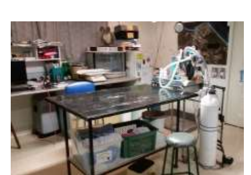
The hospital treatment room just waiting for a new arrival to be checked over.