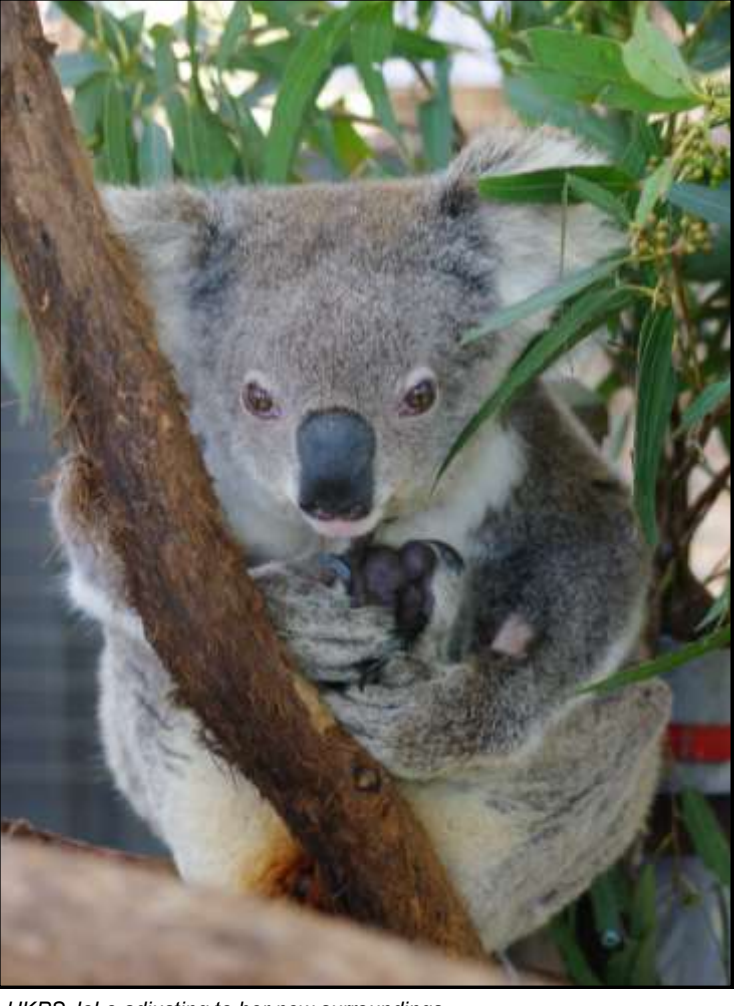
causative organism HKPS JoLo adjusting to her new surroundings.

It is worth noting that this is not considered a zoonotic disease (transferred from animals to humans). As HKPS Jo Lo has a very low reading of Crypto and with all other factors appearing to be ok – it looks like Jo Lo will be with us for quite a while.