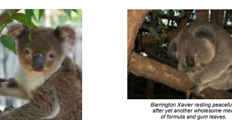
Watonga Wonder just looking as cute as she always does!