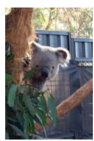
Wyandra JJ says "Well tell me....are you looking at me?"