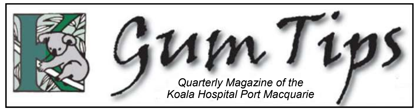
3rd Quarter 2016