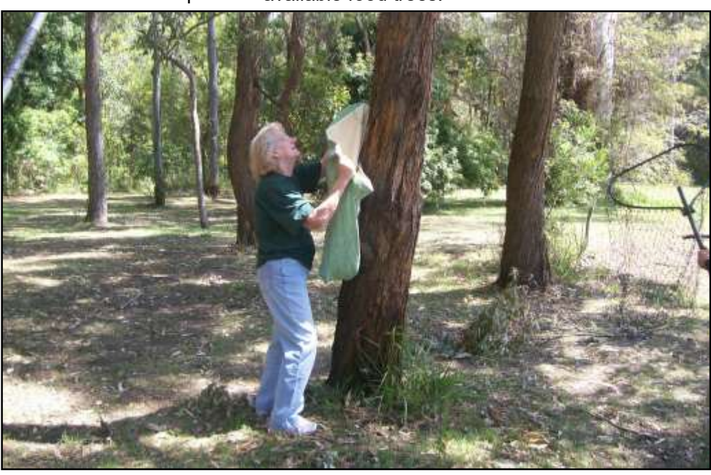
The canvas bag – the most important rescue tool. It not only protects the handler from being scratched or bitten, but allows for "quick grabbing" of the koala. Most koalas settle down quietly becoming less stressed, when placed in a bag for transport and further handling.

Wild koalas have been found in some odd places such as top floors of three storey carparks, escalators in shopping centres, sitting on fuel pumps at marinas, front seats of cars, sitting on pushbikes, outside coffee shops, in factories and lounge rooms in peoples homes. As the habitat continues to decrease, the numbers of koalas needing to be rescued increases as koalas have to travel further and further distances in search of available food trees.