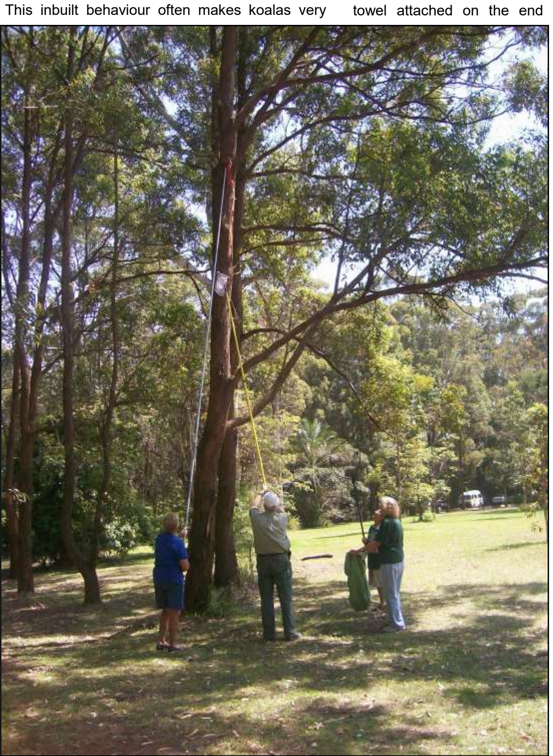
A demonstration of capturing a koala using the extendable poles (one pole bringing the koala down and one pole blocking access to side branches), a hoop net for difficult catches and the canvas bag for capturing the koala.

Koalas can often outsmart the team of rescuers by jumping so easily from branch to branch, and as the