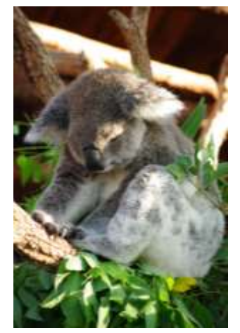
NATF Zenani says "Now I'm only counting to 10 so hide well"