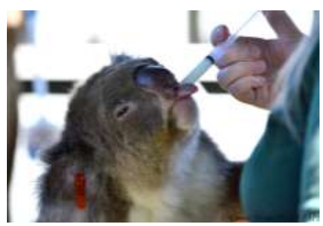
Watonga Wonder and volunteer Sheila Wonder just loves her formula as the photo attests.