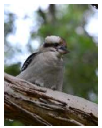
Another visitor at the hospital a Kookaburra wondering if he can be as lucky as a Magpie