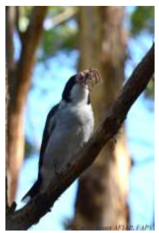
A Magpie visiting the hospital enjoying a spider for breakfast