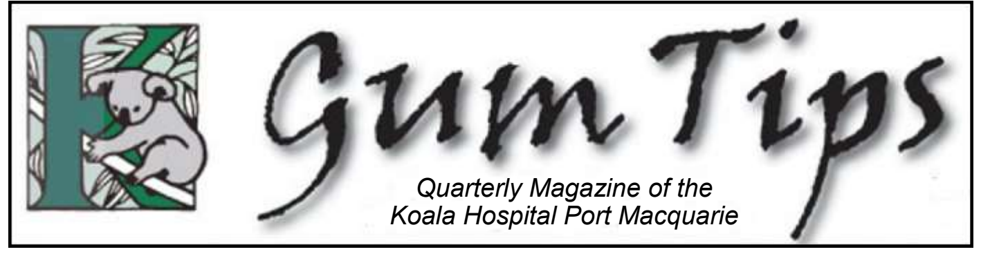
2nd Quarter 2016