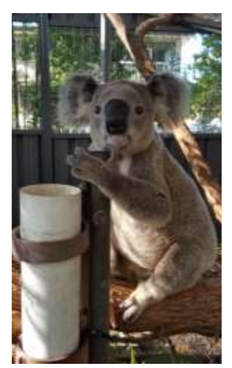
Lake Max looking a little bemused "Hello - there is supposed to be lovely gum leaves In this container"