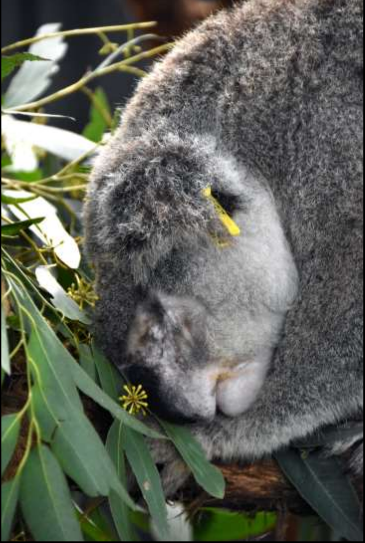
Appin Jack resting after his morning meal.

Thankfully Appin Jack has a laid back "cool dude" nature, accepting all the handling and care with ease and has settled in well to life at the hospital. He well and truly knows the time fresh leaf arrives, when the enclosure is being