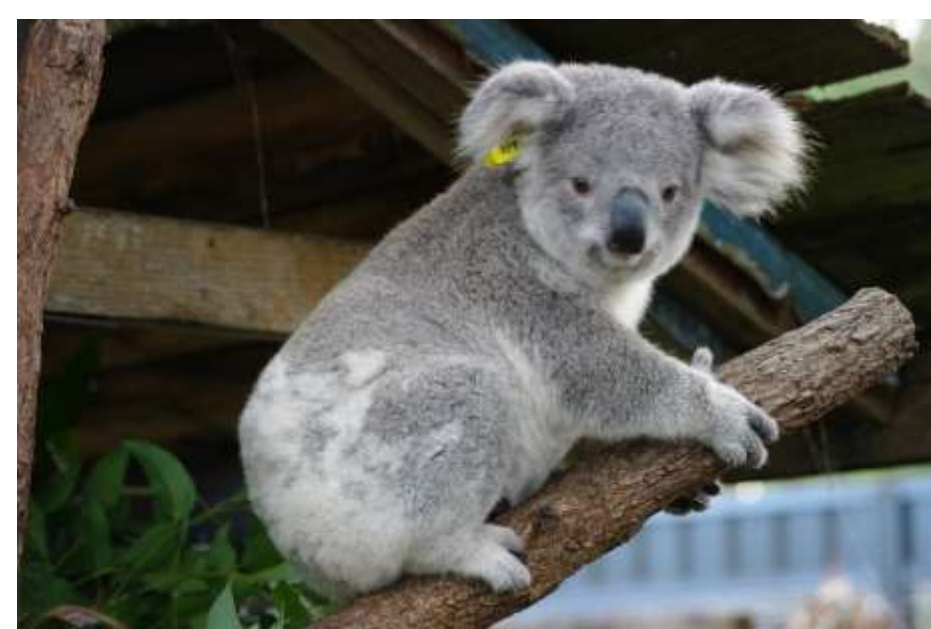
What does the future hold for one of our national icons?

"If we don't do something about the disturbing