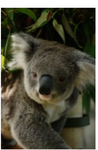
Beautiful Ocean Summer always ready for a photo.