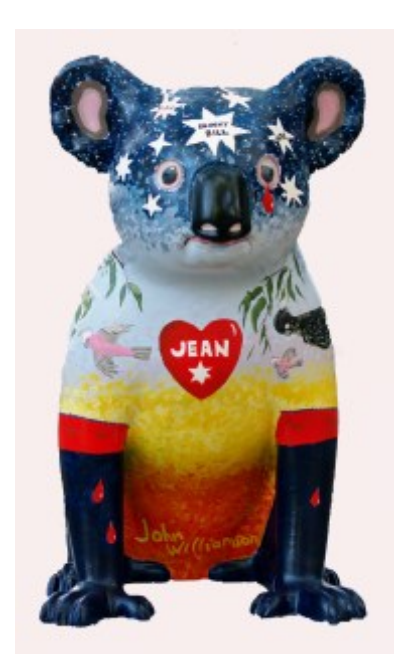
Koala Trail Icon "Sunshine"

Licensed to rehabilitate and release sick, injured and orphaned native fauna under Licence No. 10044