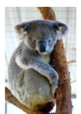
Tilpa Tilly contemplating life and a very, very wet bottom.