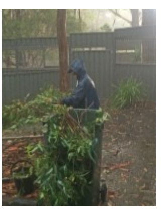
Australia Day 2015 was a very, very wet day, just ask our volunteer Val Looi.