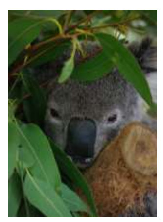
Cute and cuddly NATF Burrell looking very photogenic.