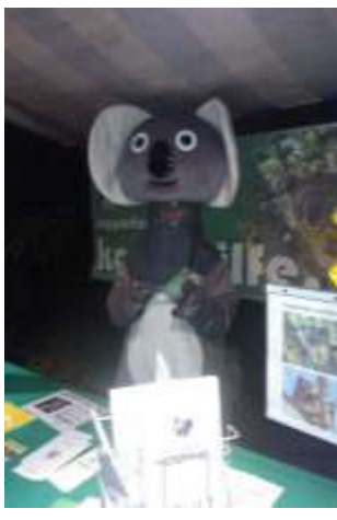
Overseas volunteer Bea at Zurich Zoo in September reminding the locals about koalas!

Best wishes for the Festive Season from all the Patients Staff and Volunteers of the Port Macquarie Koala Hospital