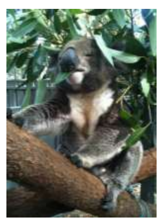
Salamander Bay Tallimba enjoyed his leafy breakfast. Sadly now in the Big Gum tree in the sky.