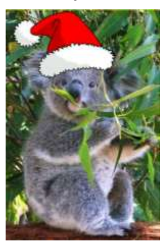
Sweet Bonnie Blaze looking aghast "What do you mean I look funny in this hat?