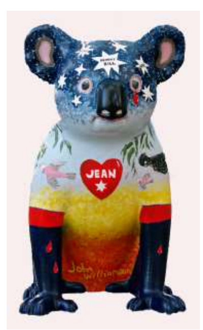
Koala Trail Icon "Sunshine"

Licensed to rehabilitate and release sick, injured and Orphaned native fauna under Licence No. 10044