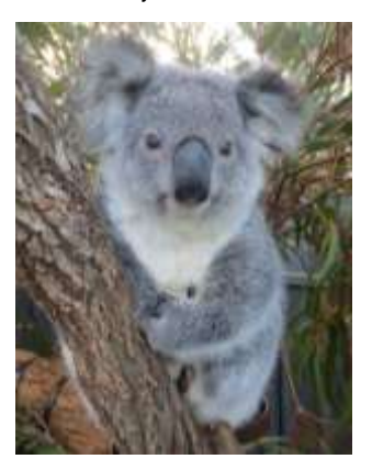
NATF Zenani found in a bushfire with damaged claws and unable to climb